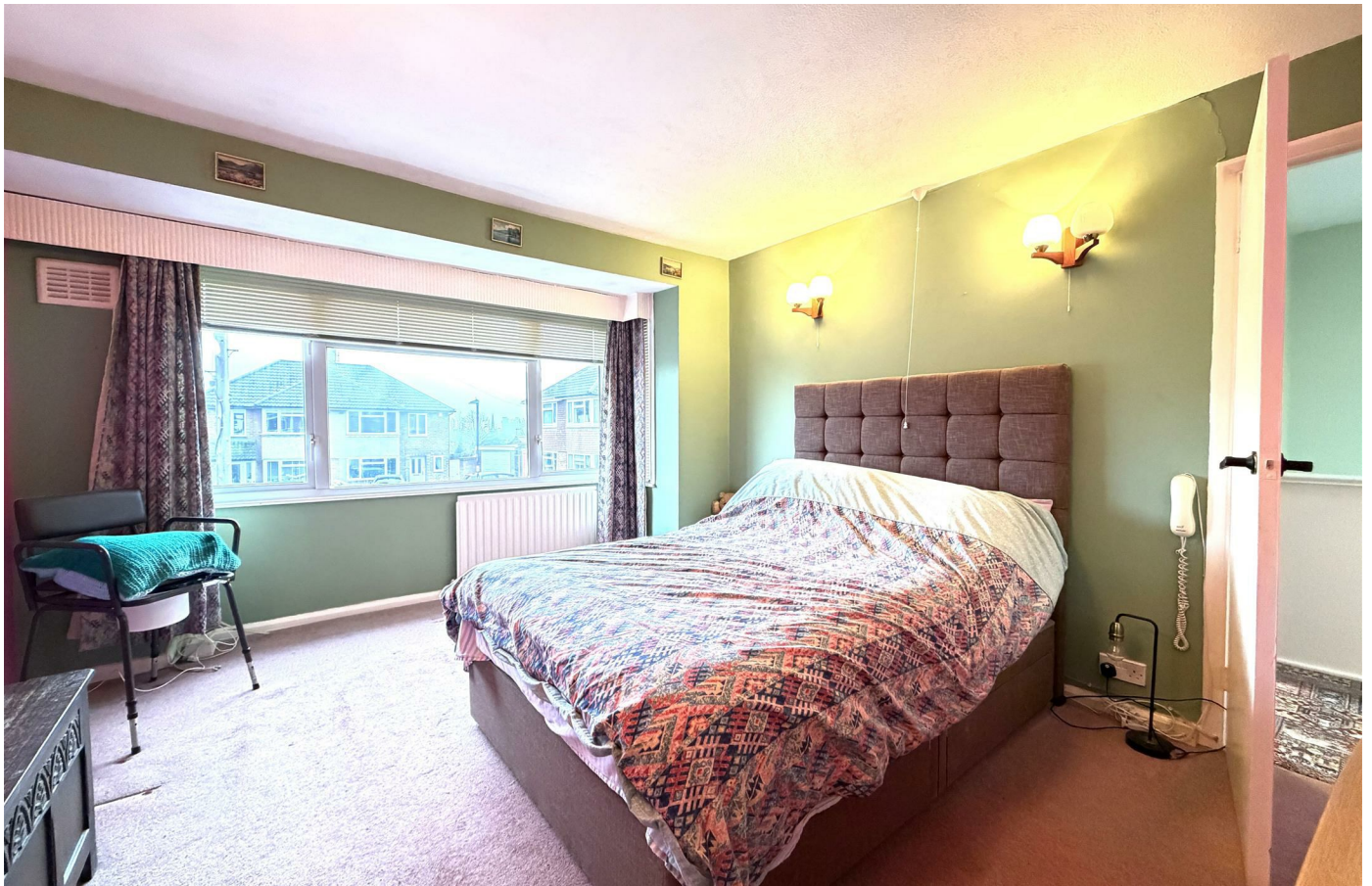
14 Highlands Close, Warwick, CV34 5JJ